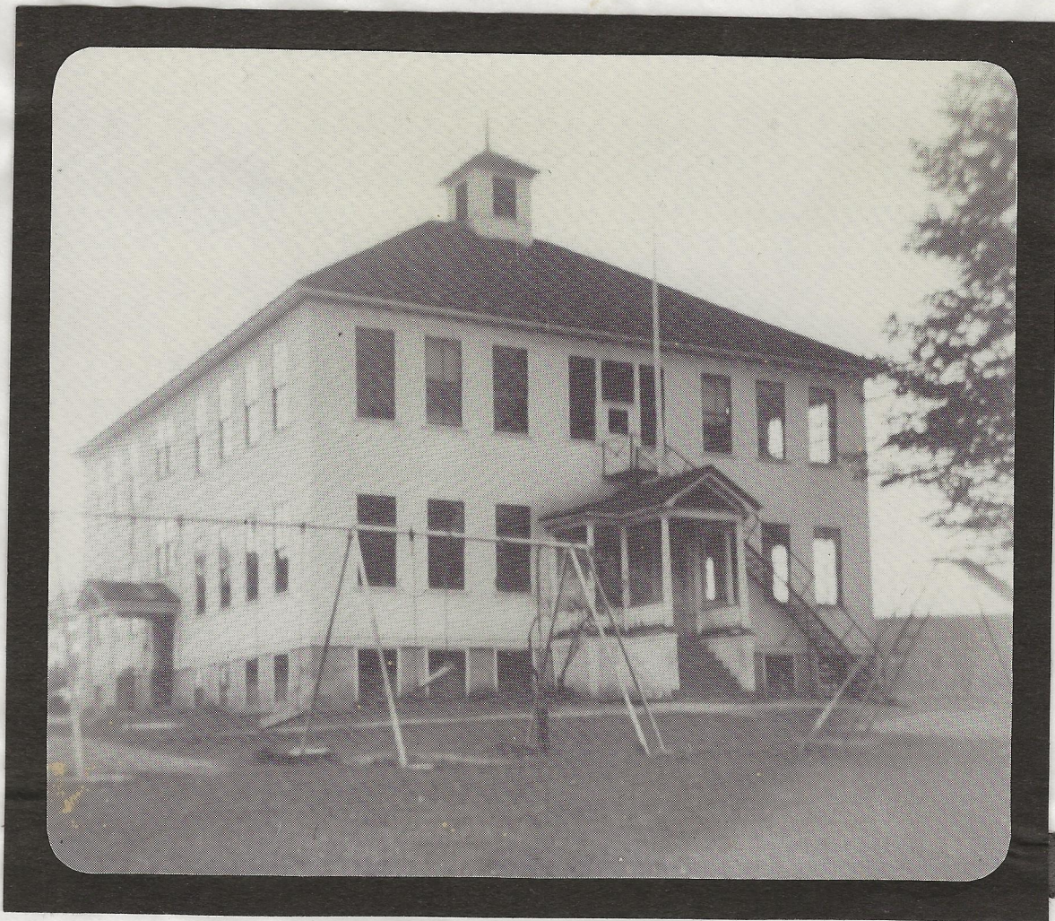
The High School in 1958

Assembled in the Bicentennial Year of 1976 by The Franklin High School Alumni Association