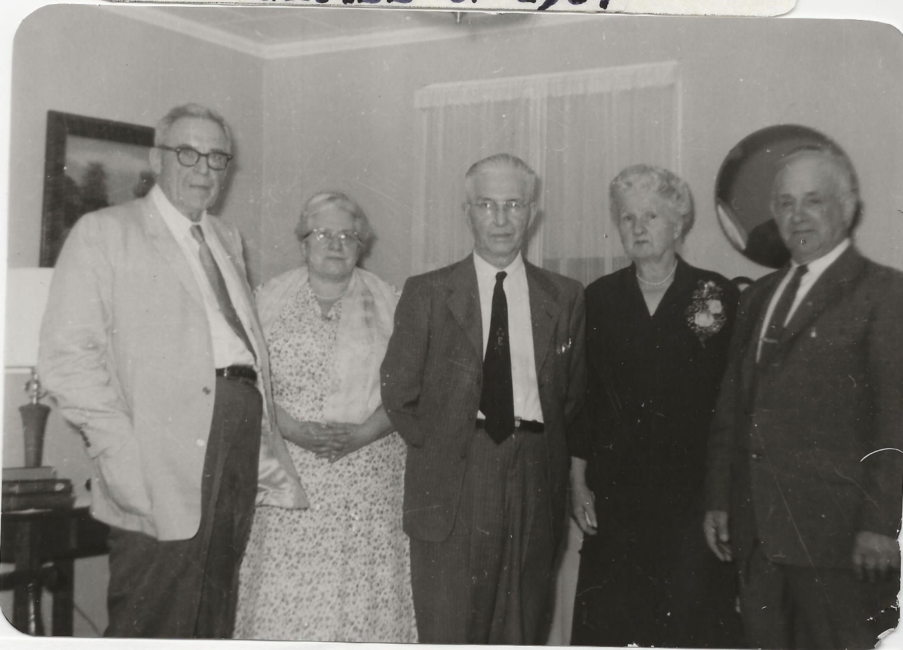
CLASS OF 1907